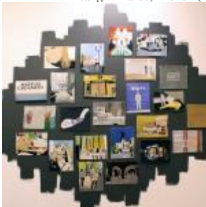
Eko Nugroho, 'La Rue Parle #9' (2012)

Nugroho's shop is another indicator of a scene that makes use of local traditions and expertise, but has its sights set on a global audience. One sees the same ambitions in Japanese artists such as Murakami and Nara, but there are very few Australians who have embraced the international market in this manner. The Indonesian new wave may have been late to arrive, but it has hit the shores of the so-called developed world with colossal force.