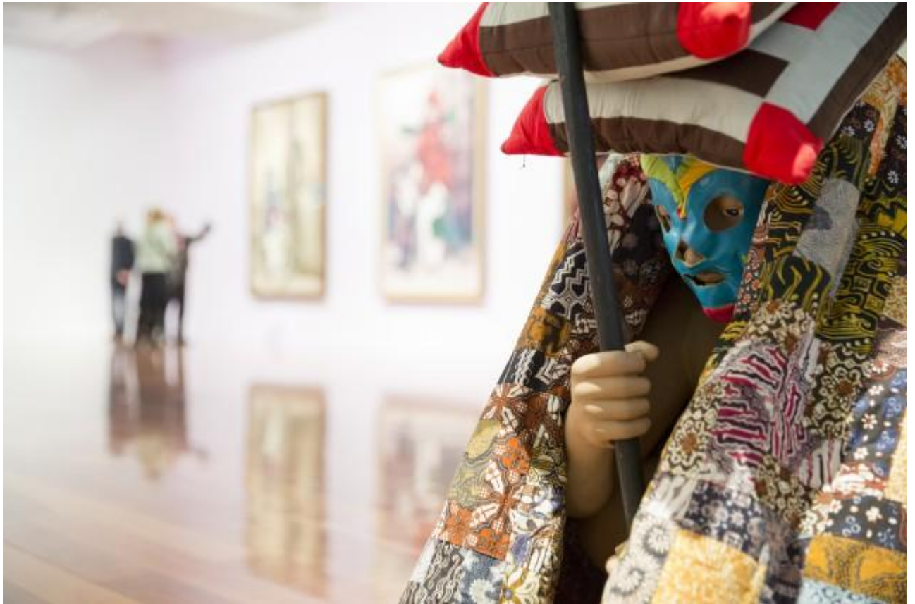
'Mooi Indie-Beautiful Indies' Samstag Art Museum Installation View (2014)

Published in the Sydney Morning Herald, Saturday 6th September, 2014