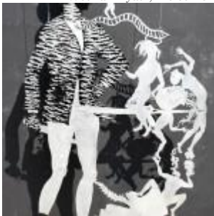
Entang Wiharso, 'Licker' (2009)