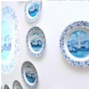
Tromarama, 'Ons aller belang' (2012)

This is the new face of Indonesian art, just as the work coming out of China today has abandoned heavy-handed references to Chairman Mao. But if you were to ask curators or collectors for their impressions of Indonesian art it is far more likely they would refer to the energetic, eclectic styles of artists such as Wiharso, Nugroho and Riyadi, who borrow images from many sources to create startling hybrids. Although all three artists move freely between 2 and 3 dimensional forms, they share a strong graphic sensibility.