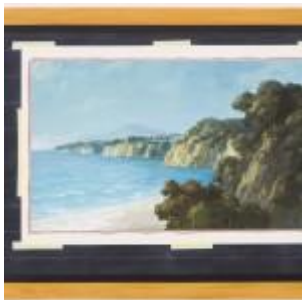
Jumaldie Alfie, 'Rereading Landscape Mooi - Indie I Know Where I Am Going' (2014)

The trio, Tromarama, who specialise in animated videos, have contributed an elaborate wall installation of 30 ceramic plates, arranged in two circles around a central projection. The street scene featured in the video is commemorated in frozen details on the plates, which are painted in blue and white, like Delftware – a style originally inspired by Chinese pottery, then copied by oriental potters and exported to the European market. The animated image shows a truck and a bus passing by a nondescript modern western building, another disavowal of the concept of the ‘picturesque’ Indies. Such urban drabness is one of the legacies of colonialism around the world. When treated as decoration the incongruity is unsettling.